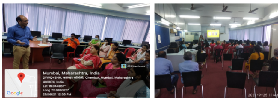
Workshop Conducted on Workplace Communication in Language Lab for Non Teaching Staff on 25 September 2021