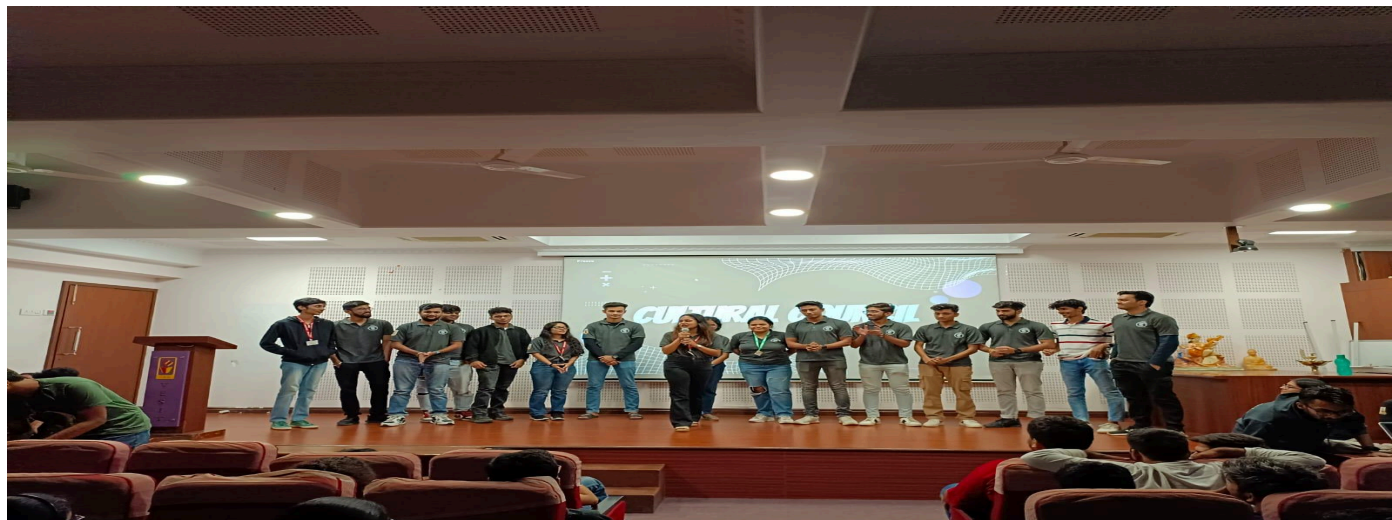
Hosts for the induction : Cultural Council