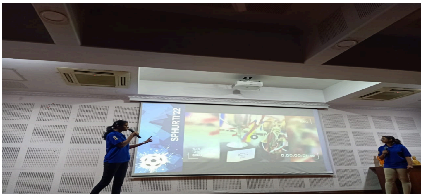
Hosts for the induction : Sports Council

After the presentation was over, all the queries of the students were answered by the council members. The audience was quite active throughout the presentation and responded with full enthusiasm.