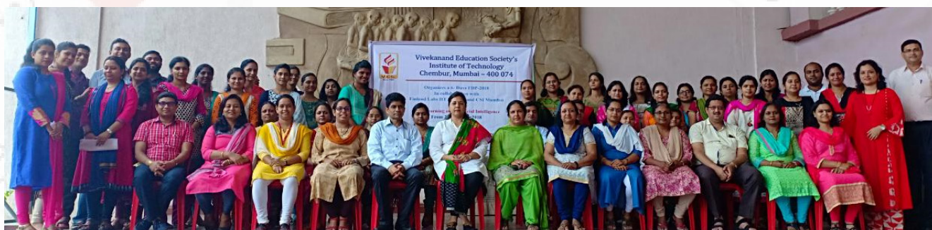
FDP on “Deep Learning and Artificial Intelligence”