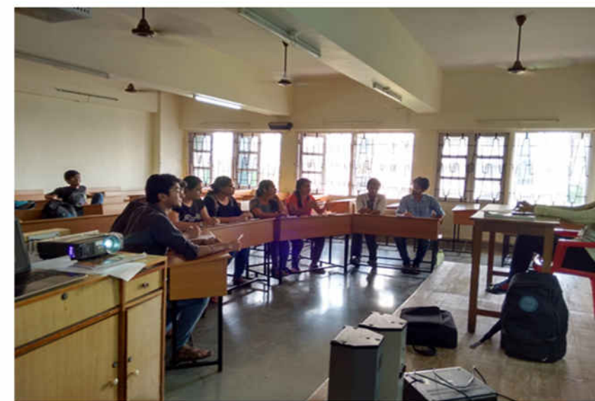
Group Discussion Event for T.E. Students