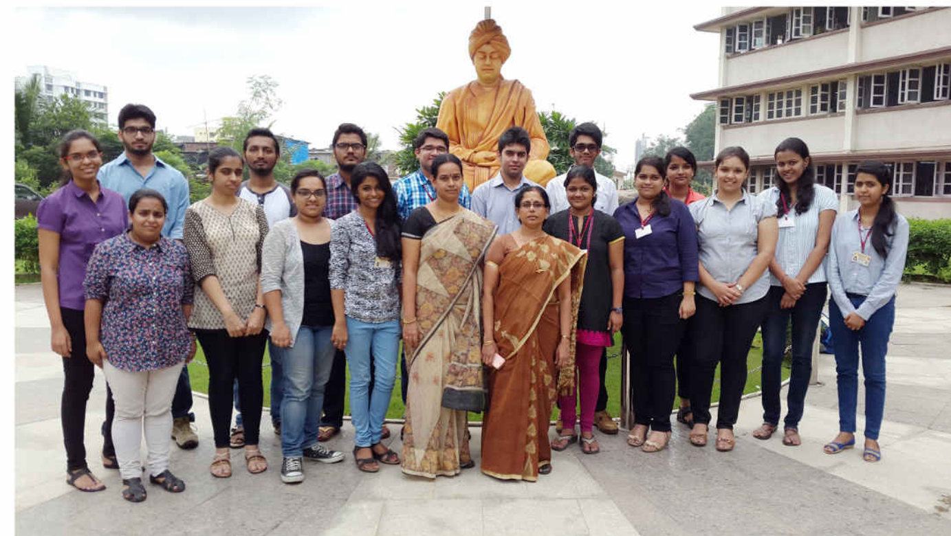
The 'VESIT Connect' team: